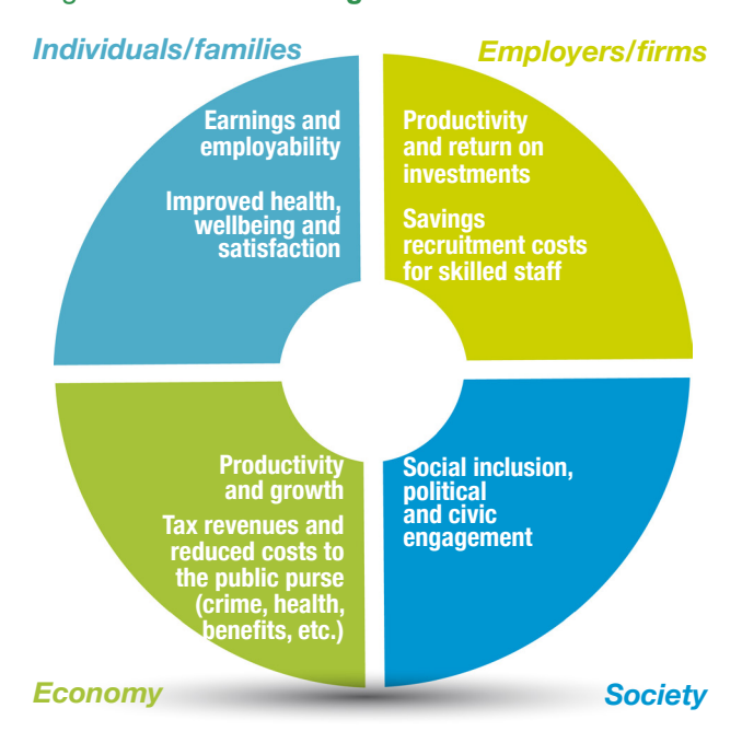
Figure 3. Benefits of higher levels of skills

Figure 3 shows the different dimensions impacted by higher levels of skills. While, at individual level, education can define major labour market outcomes, it also contributes to improving individual satisfaction, wellbeing and health status. Higher skills are also positively related to lower involvement in criminal activities and may promote trust, civic engagement, active citizenship and social inclusion. Investment in human capital also affects what could be called Schumpeterian growth: investment in education leads to a more skilled and competent population, which is able to generate and adopt new ideas that stimulate innovation and technological progress.