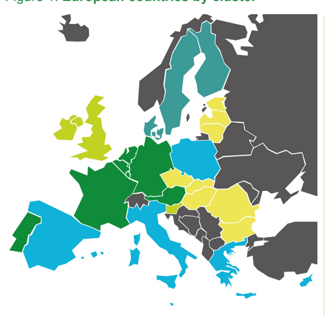
Figure 1. European countries by cluster

the labour market. Effective policy interventions tackling low skills require a clear understanding of who are the low-skilled and what are the risk factors of becoming low-skilled.