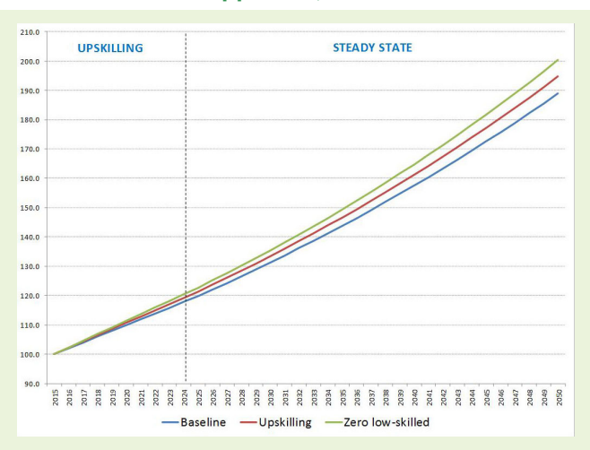
Figure 5. GDP growth under different scenarios , macroeconomic approach, 2025-50