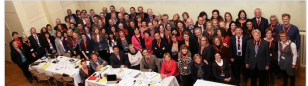
19th ELGPN Plenary Meeting family photo.

strategic work and actions - support the continuous development and enhancement of Lifelong Guidance as a priority in the process of improving the efficiency and effectiveness of the implementation of lifelong learning and employment strategies, policies and practices in the Member States. This policy practice dialogue can act as a thorough and integrated “tool” at European level to ensure complementarity and coherence between policy and practice across the Member States.