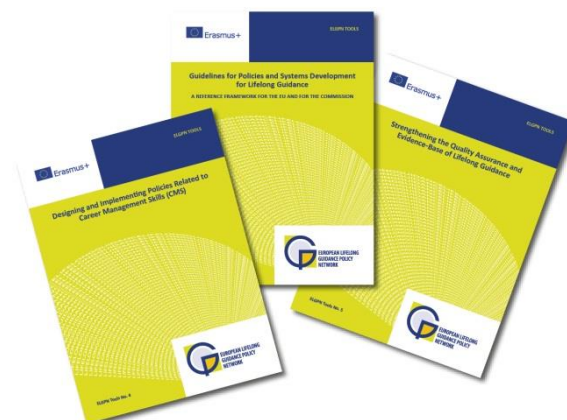
Three new ELGPN Tools, which complete the ELGPN Toolbox, were launched during the ELGPN 19th Plenary Meeting in Jyväskylä, Finland on 24 November 2015.

All ELGPN Tools and their translations to different languages are available on the Network website http://elgpn.eu .