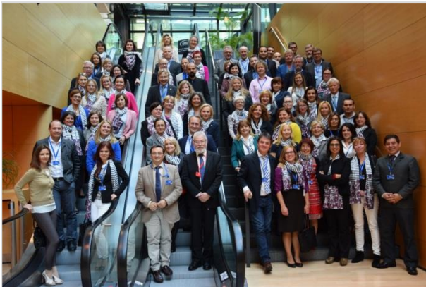
18th ELGPN Plenary Meeting family photo.

The 18 th ELGPN Plenary Meeting was held in Luxembourg on 28–29 September 2015. The meeting was jointly organised by the Luxembourg Presidency and the European Commission.