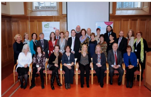
Family photo of the Irish National Forum on Guidance.