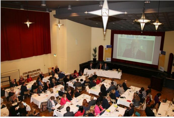
Minister Jari Lindström (the Finnish Ministry of Employment and the Economy) gave the welcome address.

The Network also discussed options for further systematic European co-operation in lifelong guidance practice and policy development beyond 2015. The members noted that lifelong guidance policies can be viewed as a strategic response and partner in the implementation of EU policies in education, training and employment such as worker and learner mobility, the development of a common EU labour market, and addressing the needs of early school leavers and the NEETs. Lifelong guidance has an integrative policy role to support lifelong learning and lifelong guidance systems support the achievement of policy objectives. The mutual learning on the development and implementation of EU Lifelong Guidance policies between the EU Member States needs to be supported by the Commission.