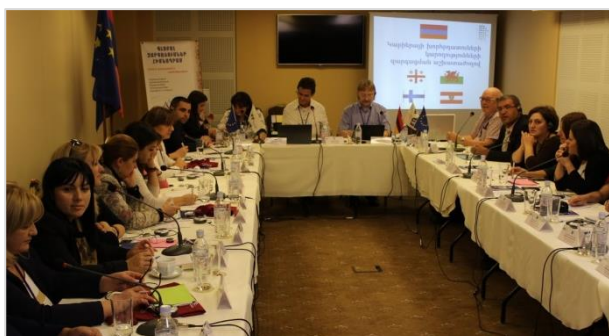
Table discussions during the national workshop in Yerevan on 12 October 2015.